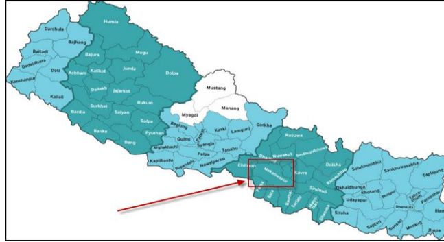
Figure 3: Map of Nepal showing the Makwanpur District.

For wheat to thrive, 150-200 mm of rain is optimal (Bhandari, 2013). Over a recent period of 12 years, measurements have shown that an average of only 81 mm of rain has been recorded during this region’s wheat season from October to April (“Makwanpur Garhi Monthly Climate”, 2012). Therefore, with a shortage of at minimum 70 mm (150mm subtract 81mm) of rain for optimal wheat production, it is clear that wheat crops would benefit from the use of harvested rainwater for irrigation during an average season.