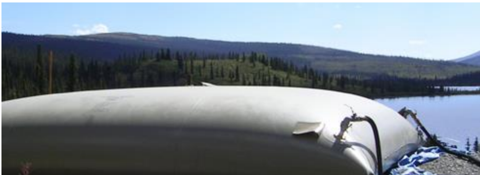
Figure 1: Terra Tank.

As a leader in the supply of equipment for mobile firefighting operations, their Bambi Bucket is an essential tool in the control of remote site wildfires, and has a 90% share of the global market (“SEI Industries Products”, 2015). Other SEI innovations include their Arctic-King, Desert-King, and Jungle-King fabrics, all designed for long lasting performance for a variety of applications including: oil, gas, environmental spills, mining, aviation, military, emergency drinking water, and agriculture (“SEI Industries Products”, 2015). SEI products have been tested in extreme conditions for outdoor use (“SEI Industries Products”, 2015) which makes them a leading contender for long term water storage over alternatives such as open air portable lagoons. While both bladders and lagoons boast easy setup, lagoons would require additional evaporation prevention materials to ensure maximum containment of captured rainwater. For this reason, the product that is being investigated is the Terra Tank ® (see Figure 1), a durable bladder tank meant for long-term on-site water storage (“Terra Tank”, 2015).