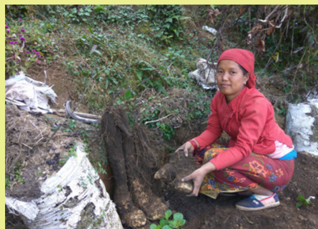
Farmer in Majhthana harvesting yams from sacks.

automation. However, when they have to repeat these task for hours it leads to repetitive motion injuries and blisters. Low cost tools from the SAK menu have managed to save both the time and reduced the drudgery for farmers.