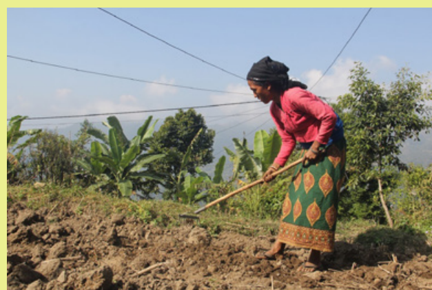
Farmer in Majhthana using farm rake.